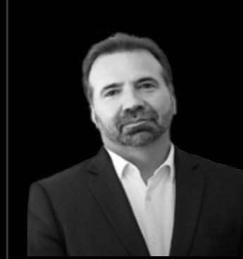
Head – PNC Architects Sobha Group