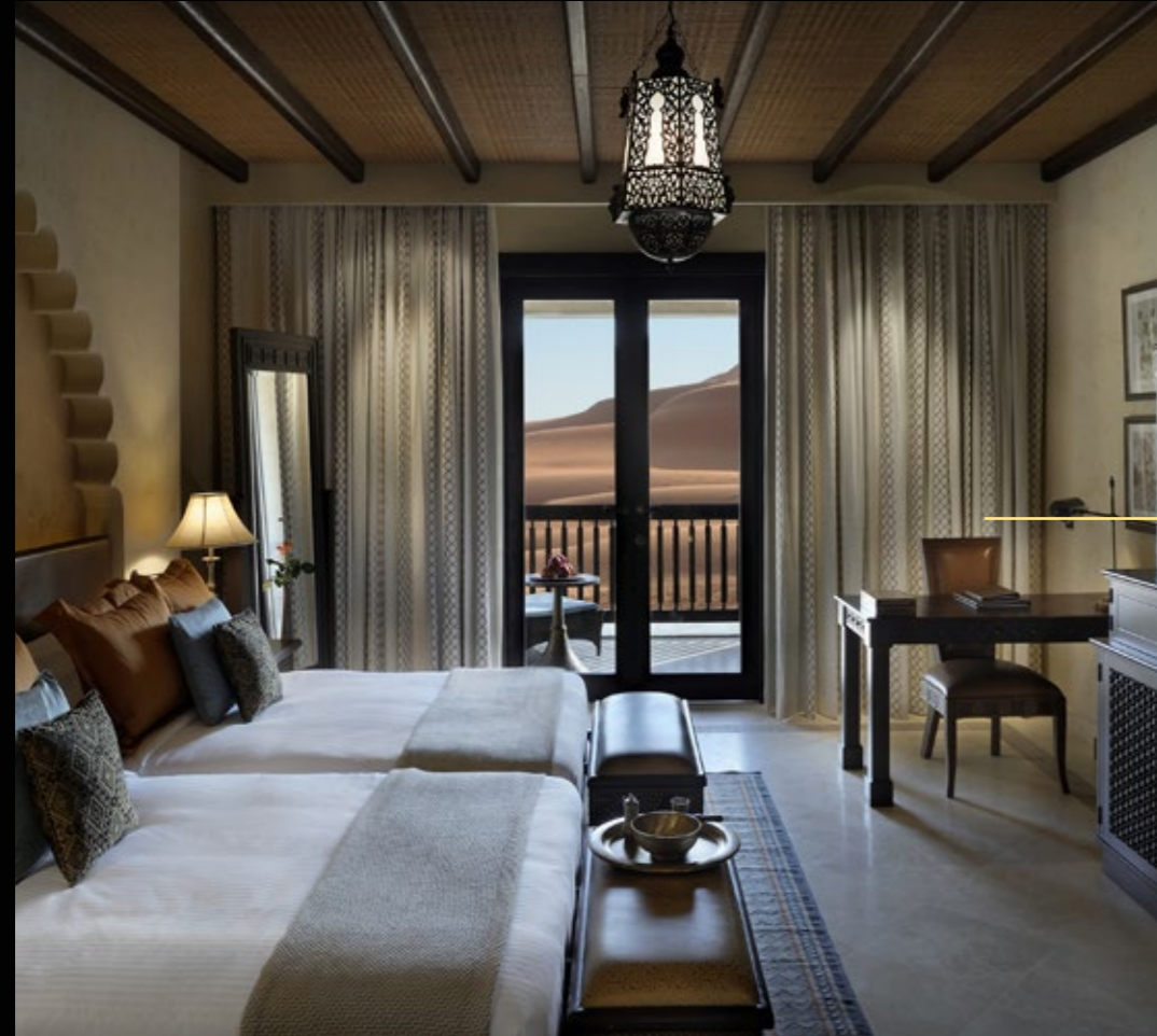
Qasr Al Sarab Desert Resort by Anantara