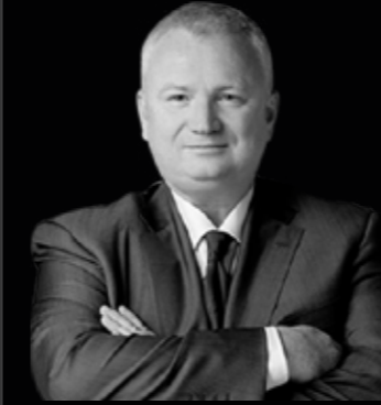
Design Director Corporate Sobha Group