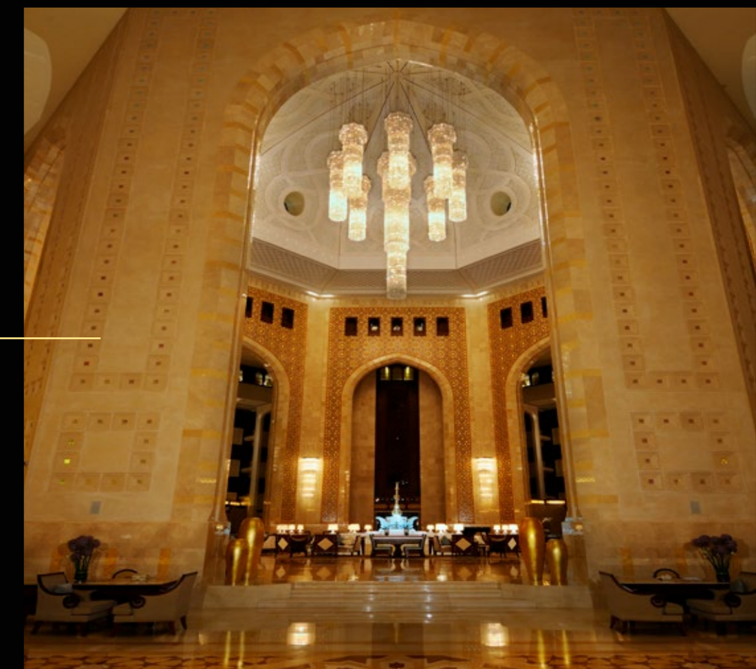
Al Bustan Palace Hotel - Oman