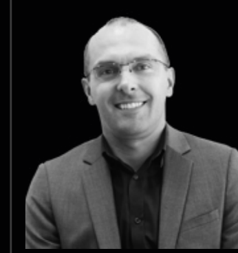
Head – Quality & Technology Sobha Group

A seasoned professional in the field of architecture, engineering and construction (AEC) with more than 27 years of work experience possessing a Master Craftsman in Civil construction and a BA in Architecture education from Germany. In his current stint with Sobha Group, he oversees and engages in project design and implementation using an independent technical inspection regime from developers side which is spearheaded by German Master Craftsmen ensuring European/German Master Quality utilizing internationally renowned construction productivity software.