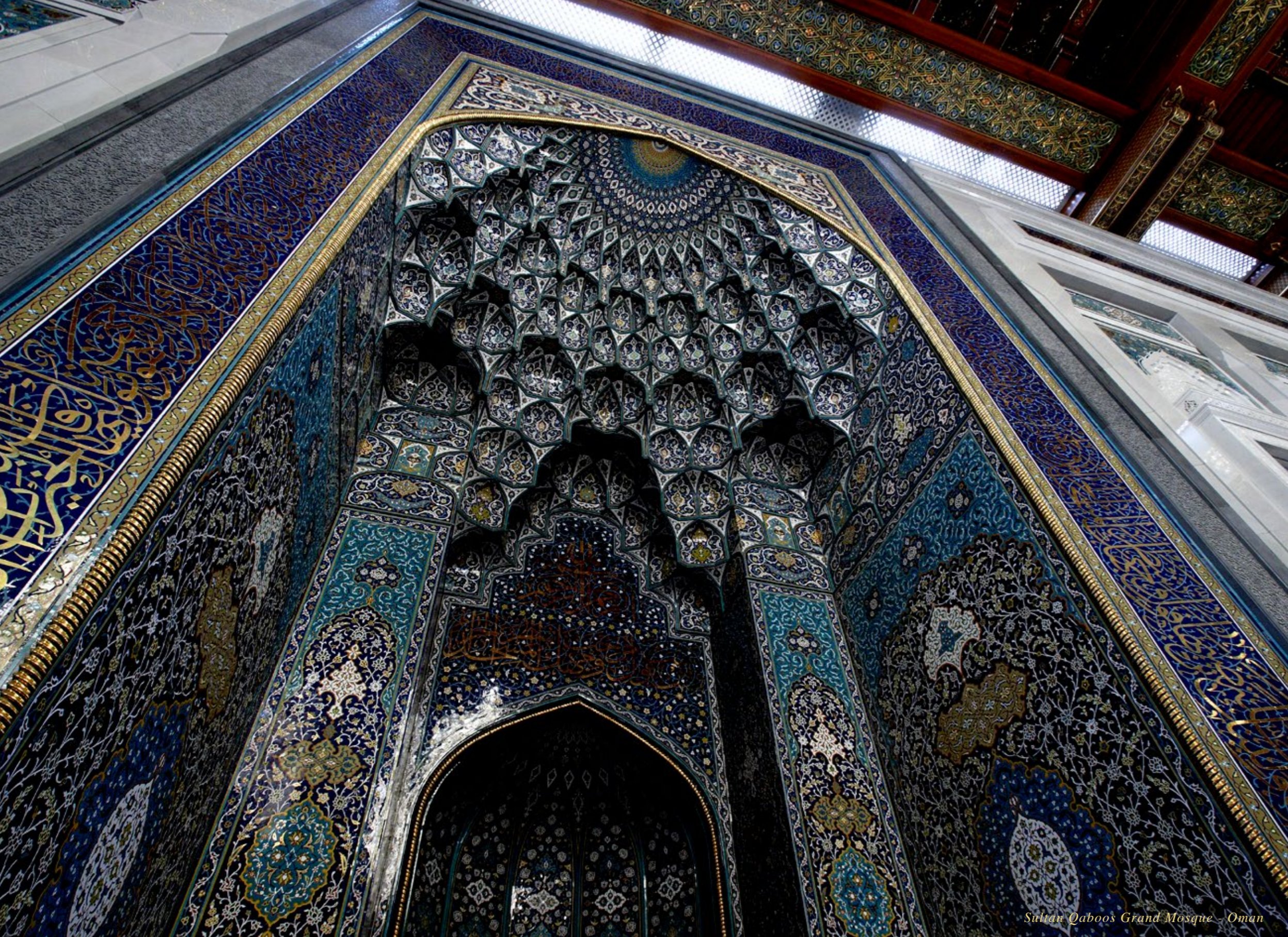
Sultan Qaboos Grand Mosque - Oman